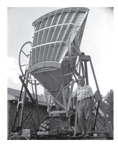
Figure 8 — An image showing preparatory work on the horn reflector antenna at the University of Toronto site of the Algonquin Radio Observatory. It was used to measure the absolute brightness of galactic emission at 707 MHz at the North Celestial Pole (reproduced courtesy of the Department of Astronomy & Astrophysics, University of Toronto).

nity for the Toronto Centre of the RASC to step up to a challenge. The Toronto Centre, a registered charity, has a long history of providing astronomy education and outreach programs around the greater Toronto area,