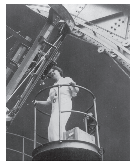
Figure 5 — Helen Sawyer Hogg at the Newtonian focus of the 74-inch telescope.

Helen's globular-cluster program was conducted at the Newtonian focus, located at the top end of the telescope. In