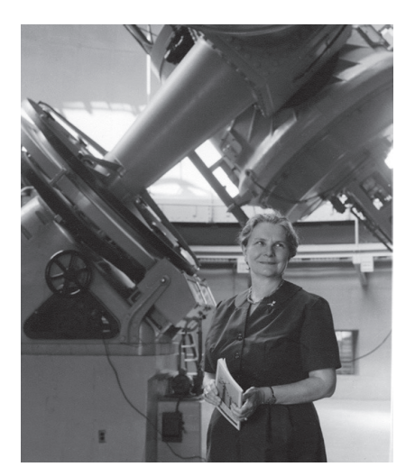
Figure 4 — Helen Sawyer Hogg and the DDO 74-inch telescope.