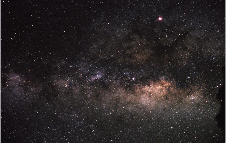
Photograph of the starry sky over La Palma taken on April 20 th , 2007, the night when the Starlight Declaration was adopted.