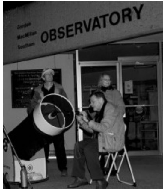
Vancouver Centre members take in the August 28th lunar eclipse.