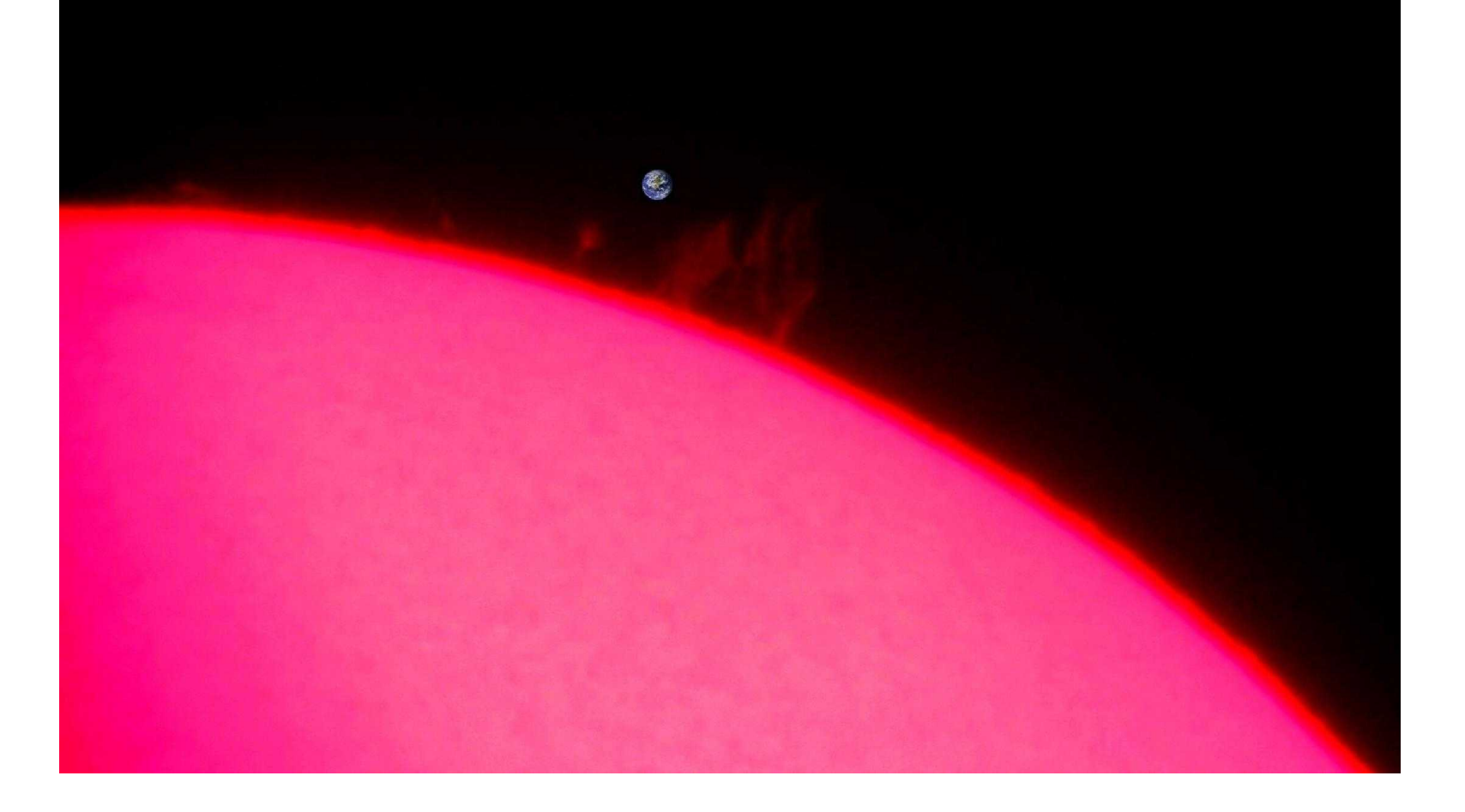
Solar Prominence, taken 2009 April 24