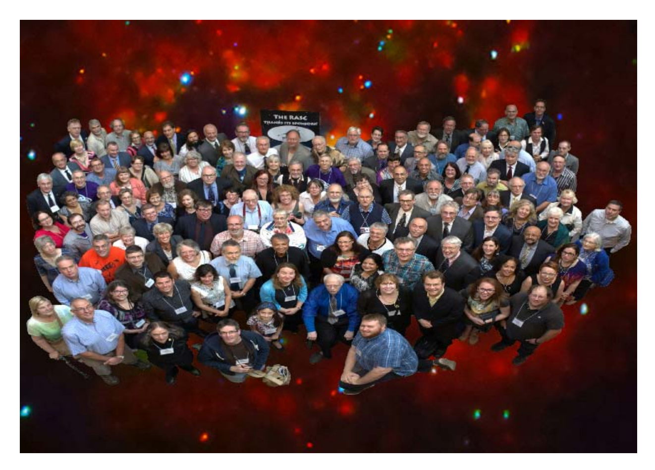
GA 2016: Group image, London, Ontario.