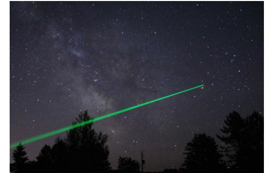
A 5 mW GLP beam aimed at a point near the star Antares. Light scattered back toward the camera made the beam visible.

Under a dark, clear sky, a GLP beam becomes invisible where there is nothing to scatter light back toward the observer. That occurs where the beam leaves Earth's atmosphere. Atmospheric extinction is less than 0.5 magnitude, so the majority of the photons in the beam of a GLP aimed into a clear sky leave Earth and continue down the corridors of interstellar space. The beam's reach is essentially infinite, although to a person in the beam looking back at the GLP , the angular spread of the beam makes the GLP appear less blindingly bright the further away it is. For example, a 5 mW (5 milliwatt, or 5 thousandths of a watt) GLP aimed at the International Space Station passing 400 km overhead will look about as bright as the planet Jupiter to astronauts on the ISS.