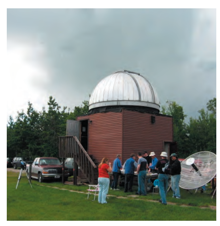
Members and guests of the Calgary Centre enjoying our annual Members' Bar-B-Q at the Centre's Wilson Coulee Observatory June 17, 2006. The dome housing the Centre's C14 and one of the two radio telescope dishes at the WCO can be seen at either end of the hot-dog fixin' table.

Our two annual public star parties held at Fish Creek Park within the city, one in March and the other in October, were very well