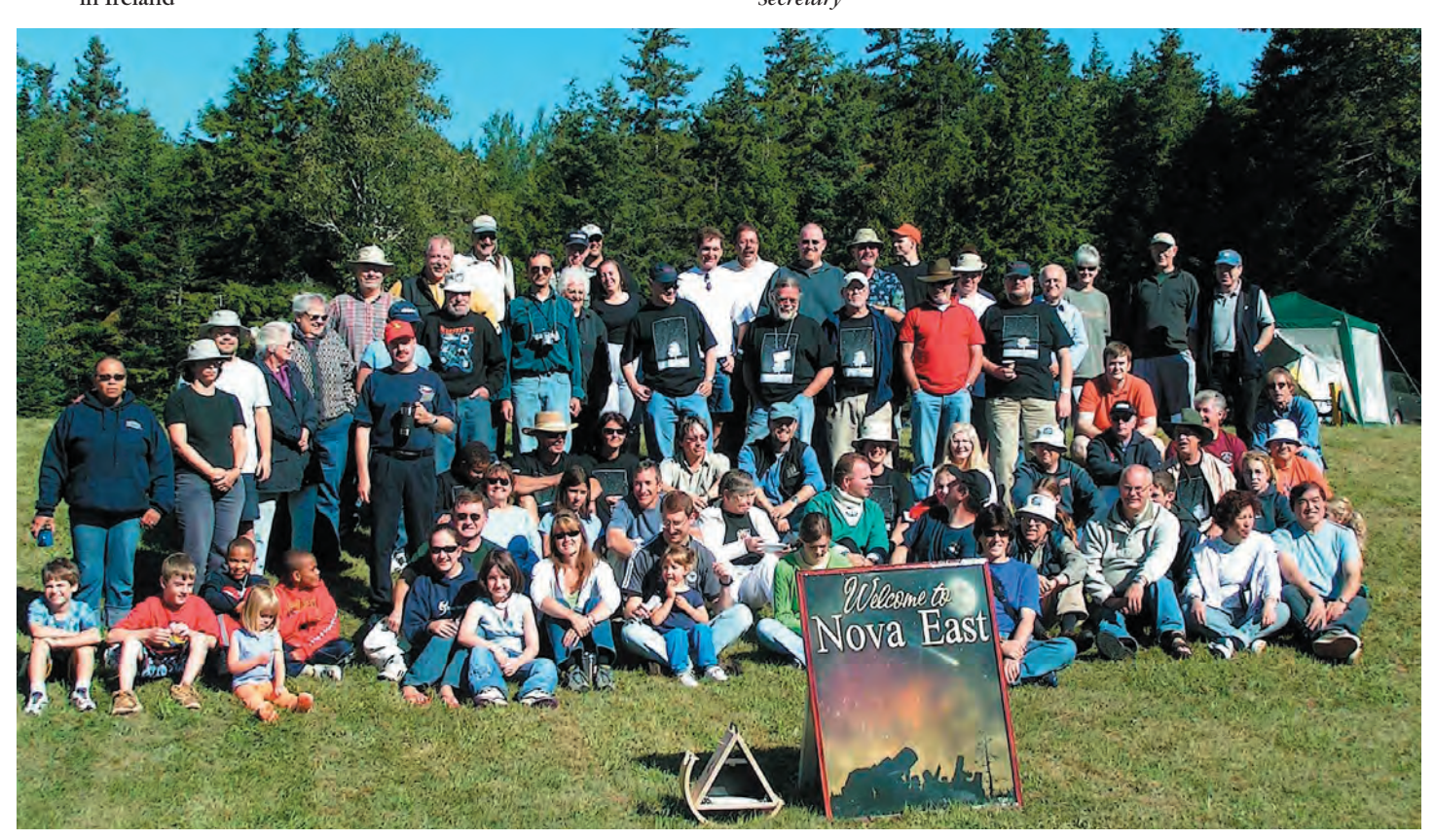
Nova East is the annual star party hosted by the Halifax Centre and two other Nova Scotia astronomy clubs: Minas Astronomy Group of Wolfville and Nova Central Astronomy Club of Truro. Nova East is beld each August at Smileys Provincial Park near Windsor, NS.