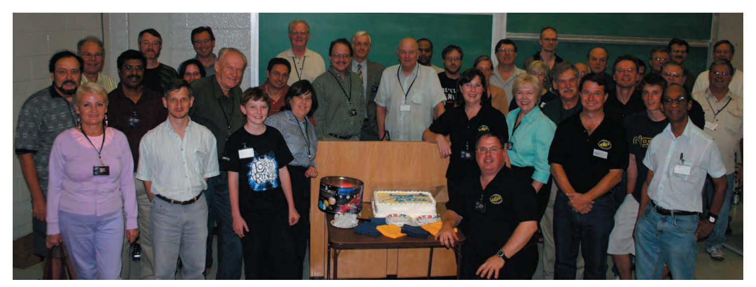
Members of the Mississauga Centre celebrate becoming the newest (28th) Centre of the RASC at its September 8, 2006 meeting at the University of Toronto at Mississauga.