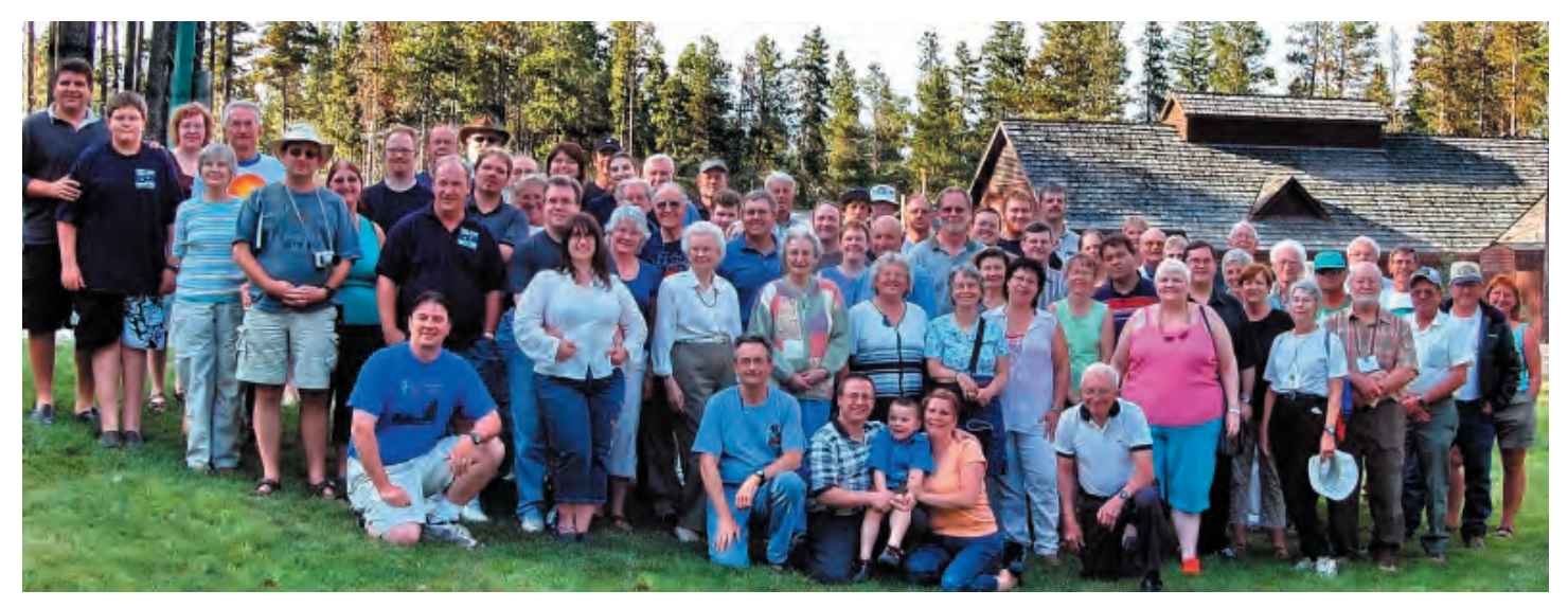
Saskatchewan Summer Star Party 2006 was put on by the Saskatoon and Regina Centres at the Cypress Hills Interprovincial Park and Dark-Sky Preserve August 24-27.

This has been another year full of activities. There has been increased use of the Sleaford Observatory by our members, as a group of keen observers has developed spontaneously and continues to frequent the site, as weather permits.