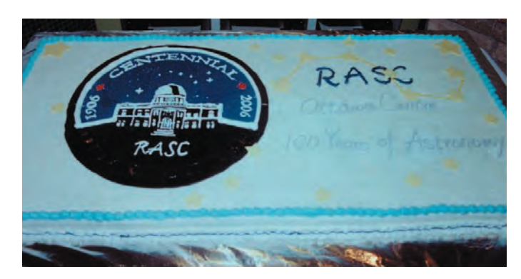
The Ottawa Centre's 100th anniversary was celebrated at the 2006 General Assembly.

The Ottawa Centre is proud to have the second-highest membership in the country out of 28 Centres. Our membership stands at 349 regular members, 8 youth members, and 39 lifetime members, for a total of 396. We also have the highest turnout at our monthly meetings, with attendance frequently exceeding 150. The Ottawa Centre is also known for having a high concentration of advanced amateur astronomers and astroimagers.