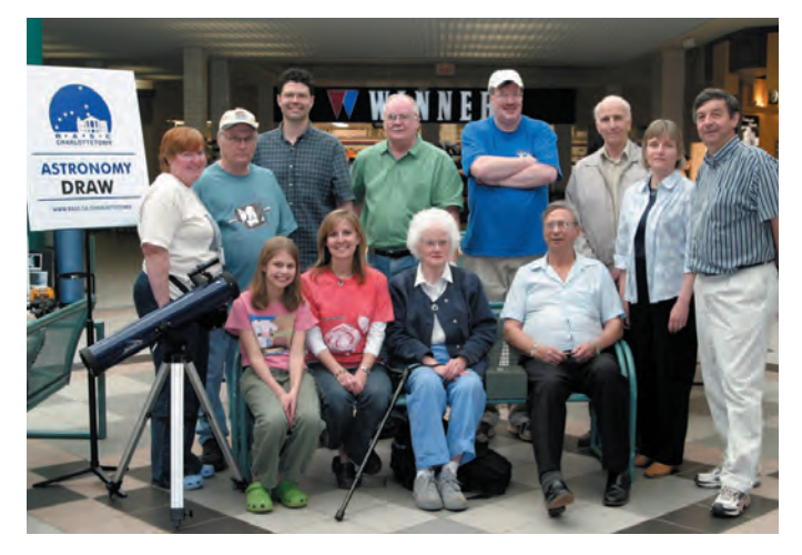
Charlottetown Centre members at Astronomy Day display at the Charlottetown Mall.