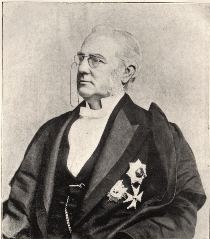
FIFTY YEARS DOCTOR IN THE UNIVERSITY OF LEIPZIG