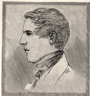
STUDENT IN THE UNIVERSITY OF LEIPZIG