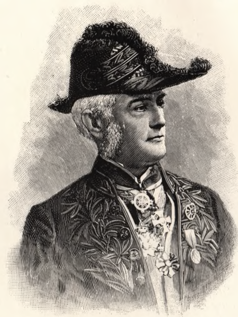
FOREIGN MEMBER OF THE FRENCH INSTITUTE