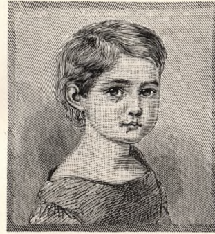
THREE YEARS OF AGE