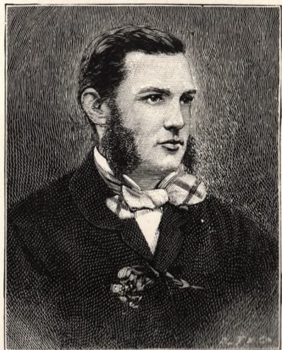
PROFESSOR AT OXFORD