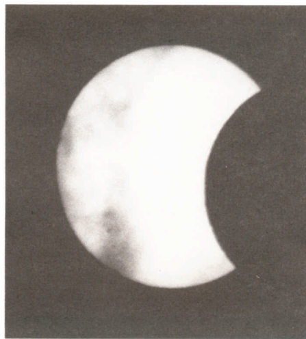
The annular eclipse at its best (at least from Canada!) Photo taken from Victoria, British Columbia by Chris Spratt.

Of course access to the observing site, in winter, was a necessity and the apparent change in our weather that autumn – rain (hallelujah!), and snow at higher elevations – focused the need for a variety of observing sites. In addition, I expected to bring my family along so reasonable roads were a necessity. I spent the eight weeks prior to the eclipse scouring southern California for observing sites up and down the coast and inland. Eventually I had a collection of sites ranging from an ocean view in the mountains above Topanga Canyon near the north limit and inside the geometric path, to seaside and inland sites in southern San Diego County including Palomar Mountain, beyond the path's