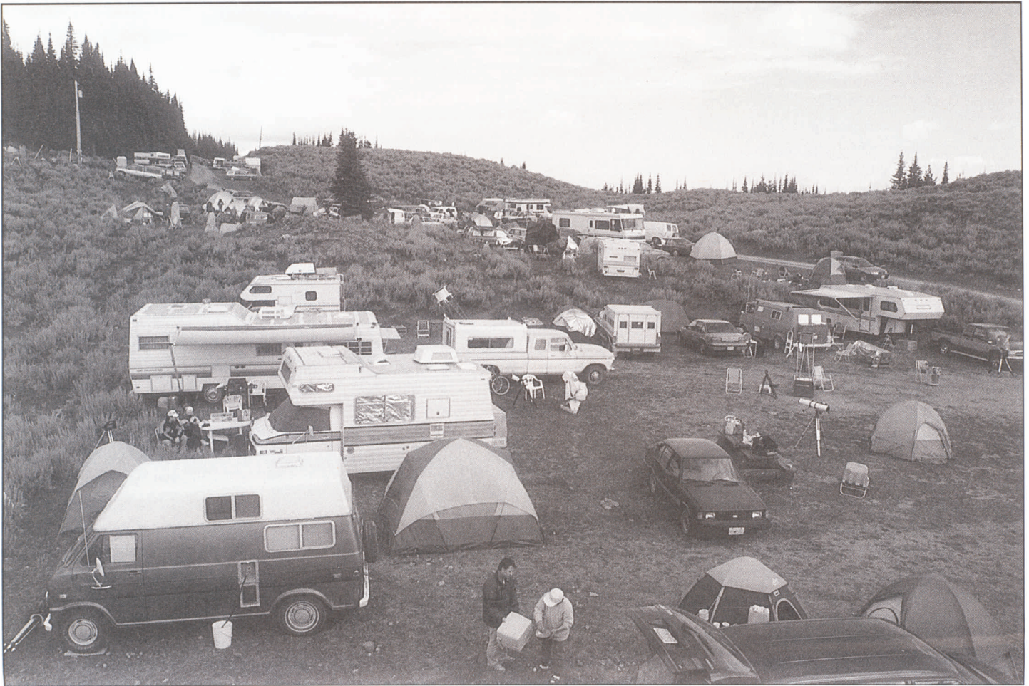
A view of the main observing site at the 1995 Mount Kobau Star Party.

that most of the rest of us had degenerated into crude, unkempt mountainmen.