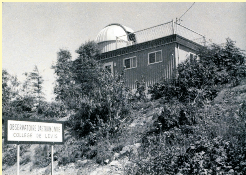
Figure 1. L'Observatoire du Collège de Lévis, tel qu'il apparaît depuis le chemin. Remarquez le dôme à l'extrémité est de la bâtisse ainsi que la plate-forme d'observation.

Deadline is two months prior to the month of issue.