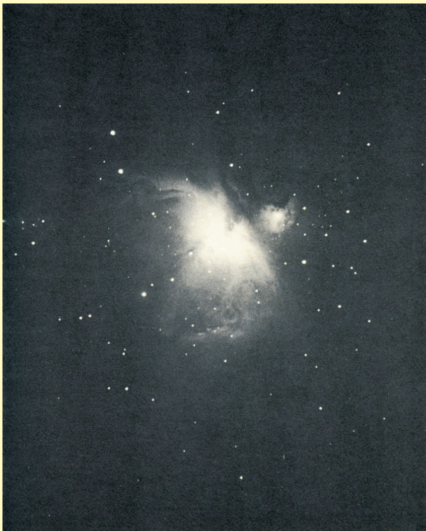
M42, le 13 déc. 1976. Céléstron 8 avec télécompresseurs ( f/5 ) sur 103aF; 15 minutes.