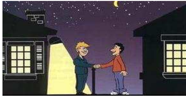
Good Lighting - Well Shielded and Aimed

Light trespass can be described as the effects of light or illuminance that strays from its intended purpose. Probably the most annoying and safety related aspect of light pollution is glare .