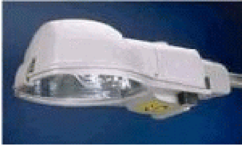
Full Cut Off light fixture similar to the one being installed in Kingston Ontario.

★ Kingston Ontario - replacing all cobra head style street light fixtures with full cutoff light fixtures - starting 2001 October