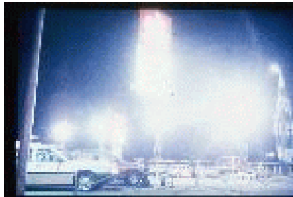
Glare from poorly aimed, overpowered lighting

Light trespass can be described as the effects of light or illuminance that strays from its intended purpose. Probably the most annoying and safety related aspect of light pollution is glare .