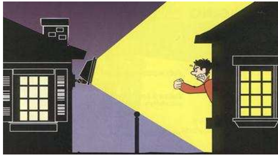
Bad Lighting - Light Trespass

Light pollution is a generic term that encompasses many different aspects of improper lighting.. The three major components of light pollution are light trespass, glare, and urban sky glow .